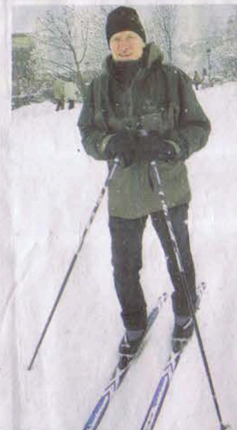
Steve Winwood enjoys his holidays in Klosters. Steve is playing 2nd July at the Volkshaus in Zurich and the Lugano Jazz Festival on the 4th July.