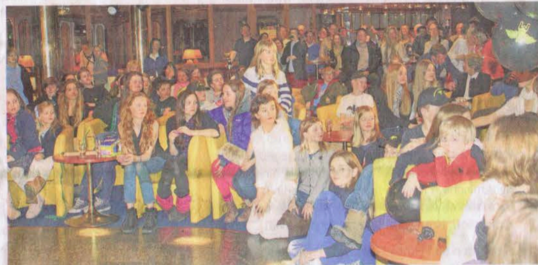
Marden's Club prize giving took place in the perfect party venue in the Hotel "Pardenn Piz Buin".

programme with "Good Morning Monday Tennis" from 10 a.m. to 12 p.m. with coaching and having fun playing in a group and on Tuesdays from 9 to 11 a.m. there is "Tennis for Everyone" where you can play doubles/singles with members of the local tennis club and on the Wednesday evenings from 7 to 9 p.m. there is "Beer o'clock Tennis" also playing doubles/singles with local members ( www.a-t-a.ch ). The dates for the Kid's Camp Klosters is from 8th July to 16th August and they