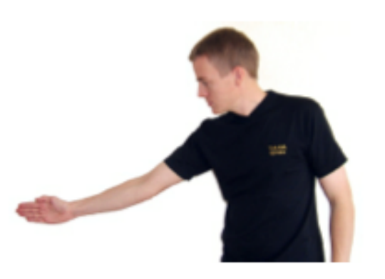
JUNBI / HYE CHYO